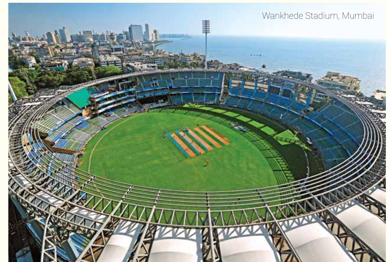
Wankhede Stadium, Mumbai