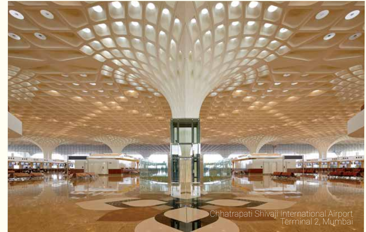
Chhatrapati Shivaji International Airport Terminal 2, Mumbai